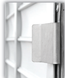
Rugged shutter clips