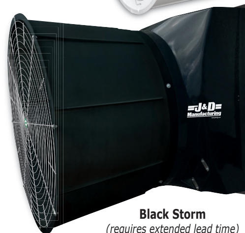
Black Storm (requires extended lead time)

⚠ WARNING: This product can expose you to chemicals including lead, which is known to the State of California to cause cancer and birth defects or other reproductive harm. For more information go to www.P65Warnings.ca.gov/product .