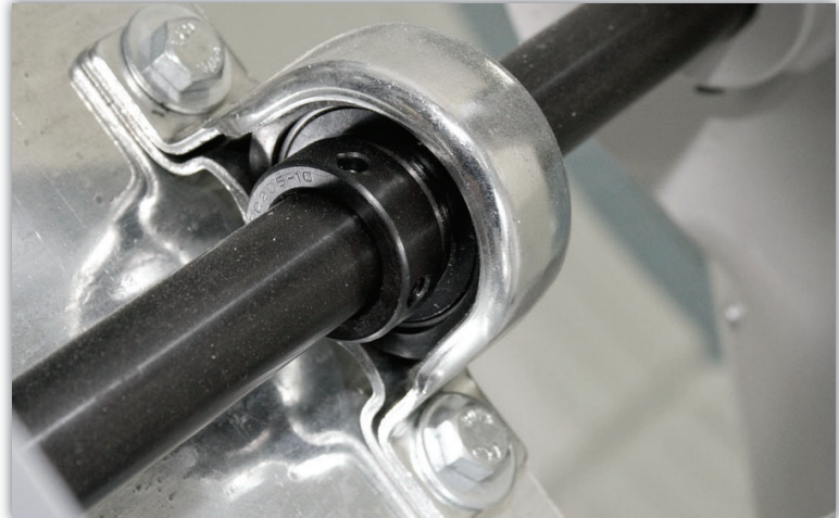
Rubber mounted shaft bearings