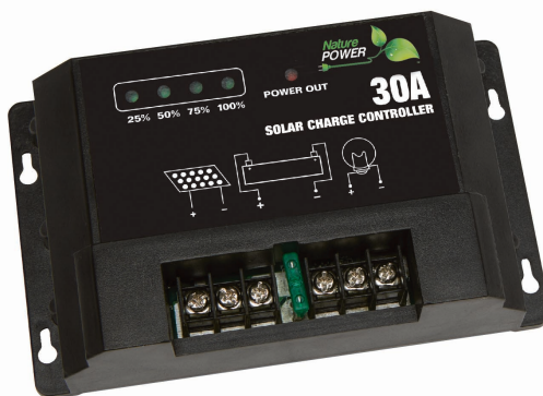
The Charge Controller