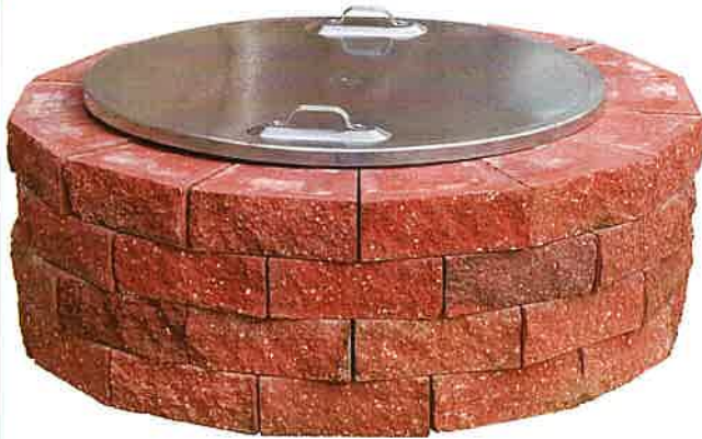
Model IAC-30 Firepit Cover shown on a firepit constructed of landscaping stone. Landscaping stone not included.

SPECIFICATION BULLETIN #SPC-FR-059 REV. 12-14