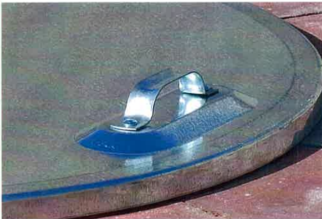
Closeup detail of a handle