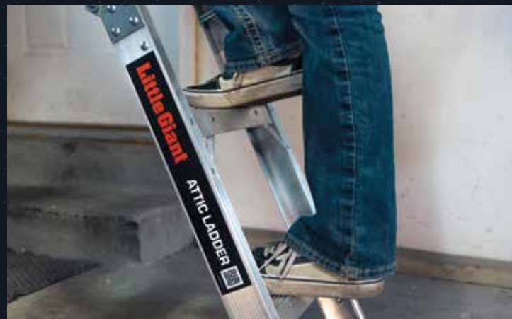
WIDE, NON-SLIP TREADS

Built to last and designed for reliable performance, this attic ladder is crafted from lightweight, aircraft-grade aluminum, and delivers long-lasting strength with smooth, easy operation.