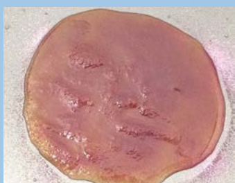
Foaming indicates neutralization in process