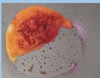
Spilled liquid has been neutralized & absorbed