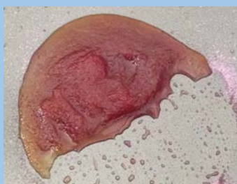
Orange color indicates non-caustic