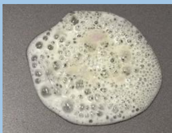
Neutralizing sodium hydroxide