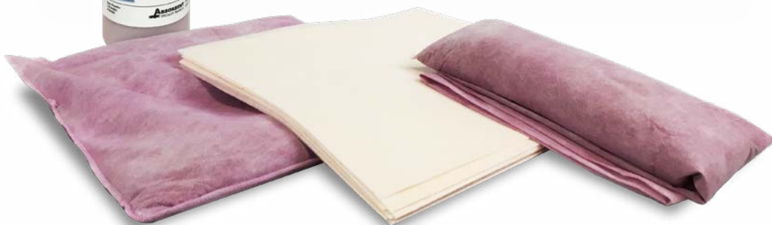
Shown: Bottle, Pillow, Pads & Sock