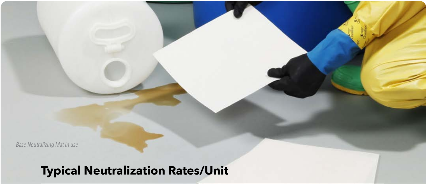
Base Neutralizing Mat in use