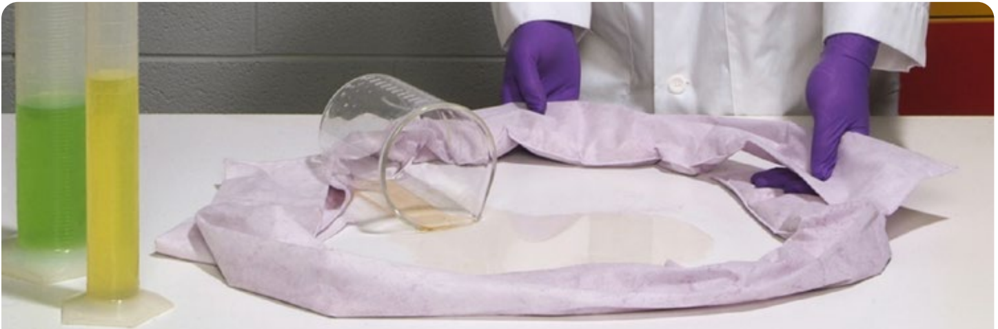
Acid Neutralizing Sock in use