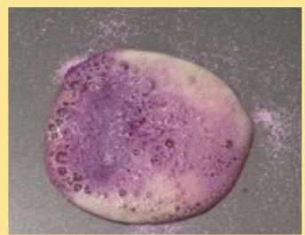
Foaming indicates neutralization in process