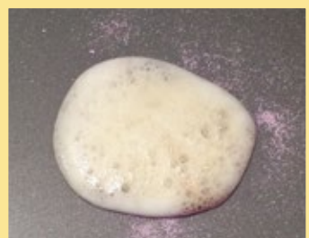
Neutralizing sulfuric acid