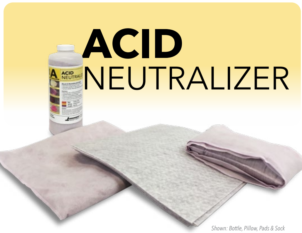
Shown: Bottle, Pillow, Pads & Sock