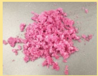
Spilled liquid has been neutralized & absorbed