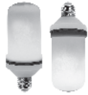
Gravity Induced Flames