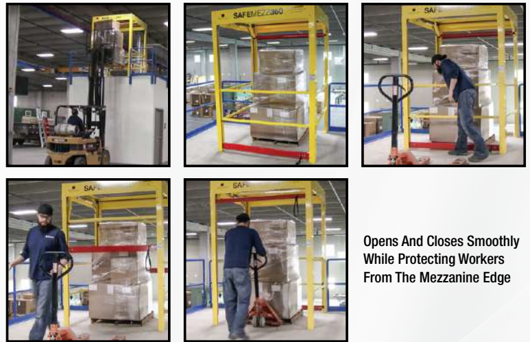
Opens And Closes Smoothly While Protecting Workers From The Mezzanine Edge