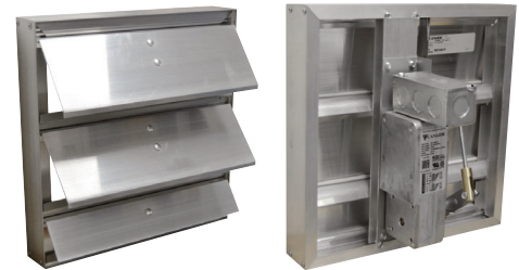
MOTORIZED BACK DRAFT DAMPER