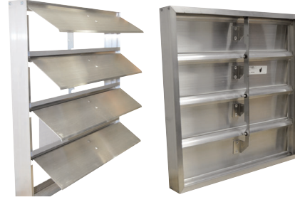
GRAVITY BACK DRAFT DAMPER