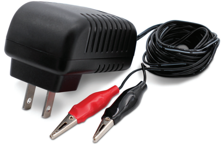
Due to continuous improvements to our products, product may vary slightly from depiction.