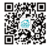
Smart Vent app