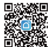
Smart Life app