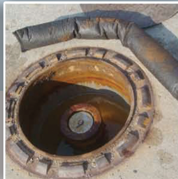
Remove saturated sock & replace if necessary