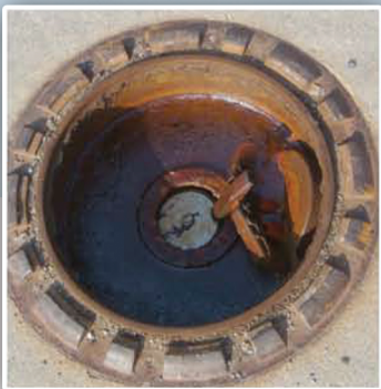
Water overflow causes cap release & leakage into tank