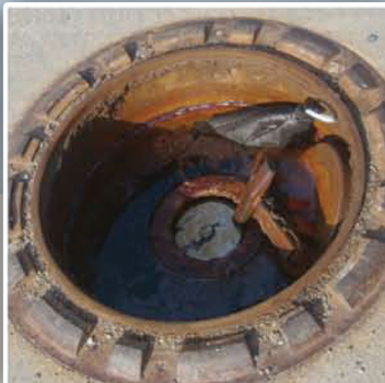
Place sock into water for approximately 5 minutes.