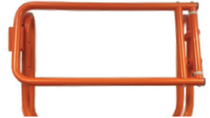
Shown installed on Safe-T Ladder (#10800)