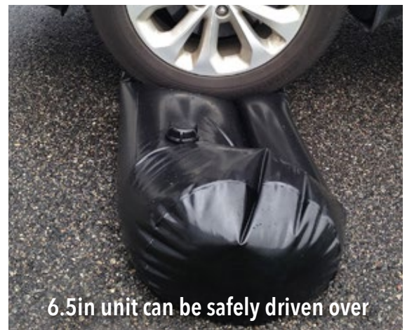
6.5in unit can be safely driven over