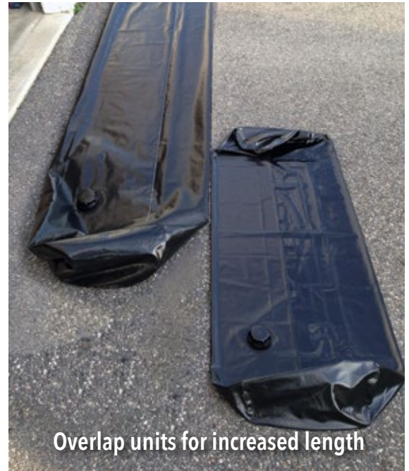
Overlap units for increased length