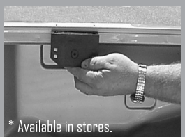
* Available in stores.

Use of Grip Rite System avoids drilling holes in rails of pickup. Better Built® recommends Grip Rite No Drill Mounting System for tool boxes.