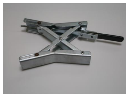
Figure #2 Handle in "closed" position

Adjusting Nut and Threaded Rod. Make adjustments in "open" position