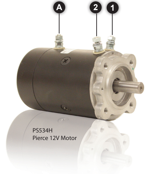
PS534H Pierce 12V Motor

Use the Pierce PS534H or PS534CH Motor on the PS528C round solenoid assembly.