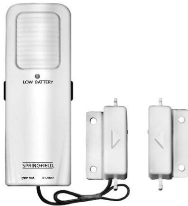
GATE ALARM MAGNETIC SENSOR/ MAGNET