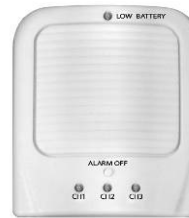
WIRELESS REMOTE ALARM