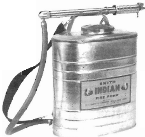
90-G - Galv.