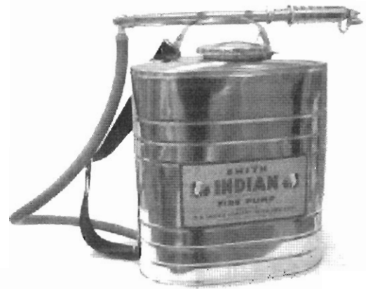
90-S - Stainless