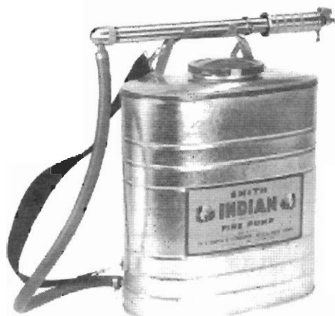
90-G - Galv.