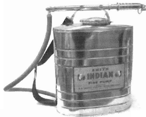
90-S - Stainless