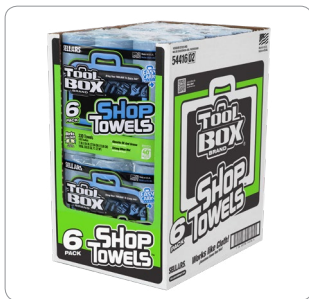
Z400 Roll of Shop Towels 6-Pack Outer Case

**SCOTT is a registered trademark of Kimberly-Clark Worldwide Inc.