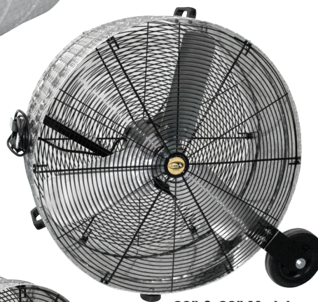
30" & 36" Models