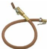
Whip Hose PN 01.109