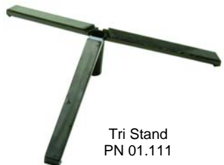
Tri Stand PN 01.111