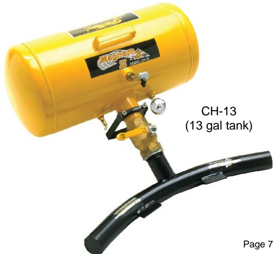
CH-13 (13 gal tank)