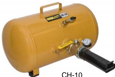
CH-10 (10 gal tank)