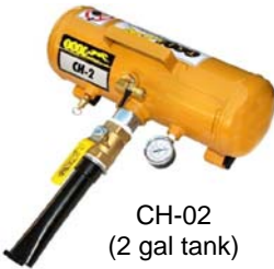
CH-02 (2 gal tank)