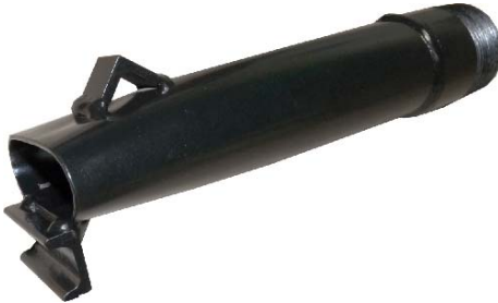
Threaded Barrel 02.103