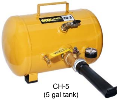
CH-5 (5 gal tank)