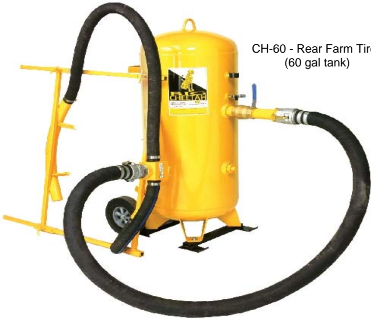
CH-60 - Rear Farm Tires (60 gal tank)