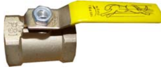
Discharge Valve 02.102