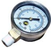
Pressure Gauge 01.106

Below are parts that come with the unit. For replacement part numbers are listed.