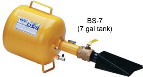
BS-7 (7 gal tank)