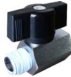
Ball Valve 04.103