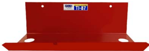
TI-87 Shelf (Wall Mounted)