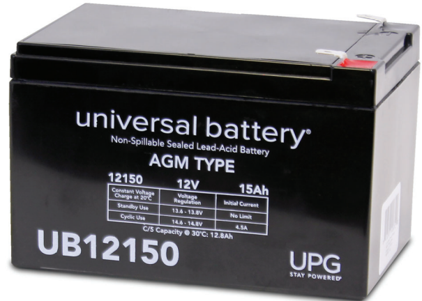
Due to continuous improvements to our products, product may vary slightly from depiction.